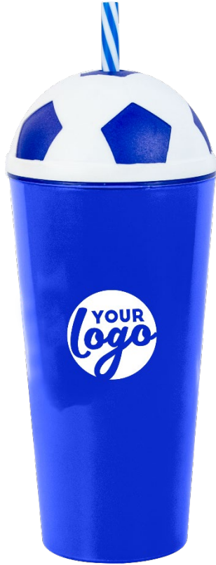
REF 1323 - SOCCER CAP TUMBLER 600ML