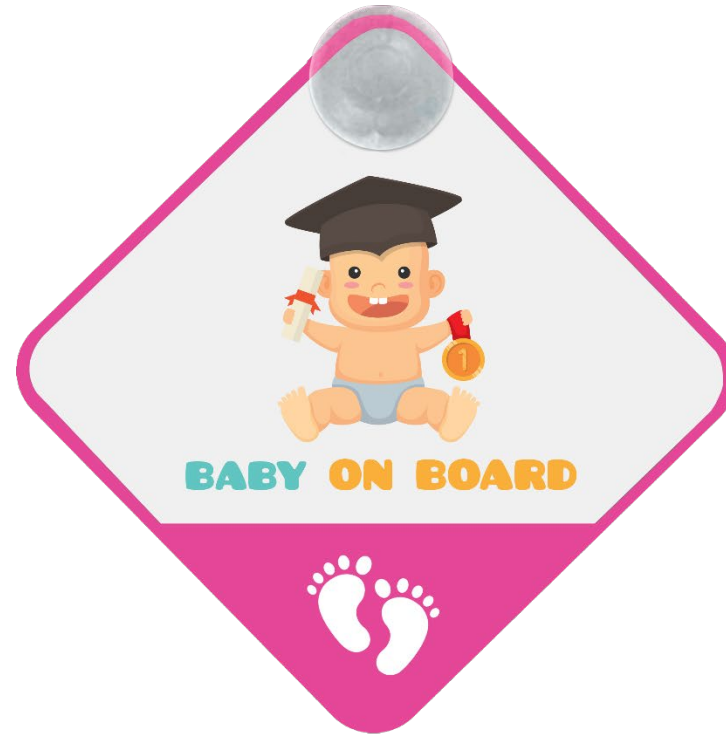
REF 205 – BABY ON BOARD