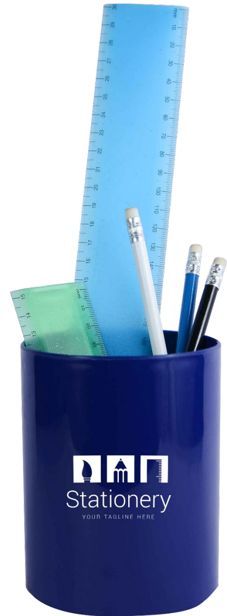
REF 1089P - CANISTER WITHOUT LID

All images are for reference purposes only and may differ from actual sample All products are available in a variety of colours