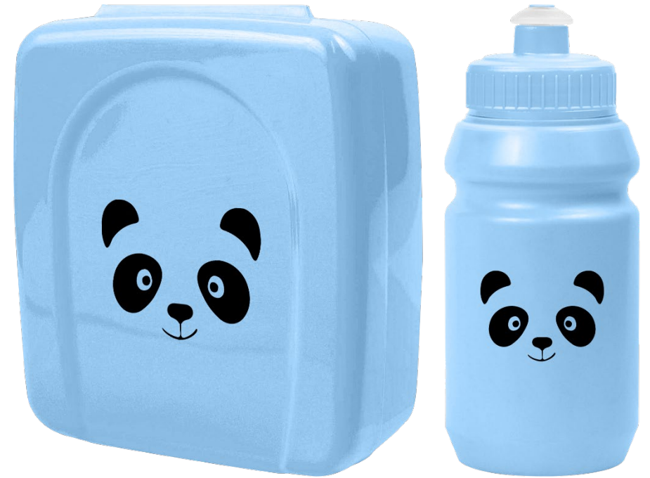
DAGWOOD WITH STANDARD 300ML