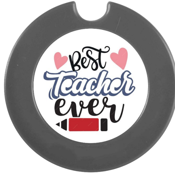
REF 301A - STICKER