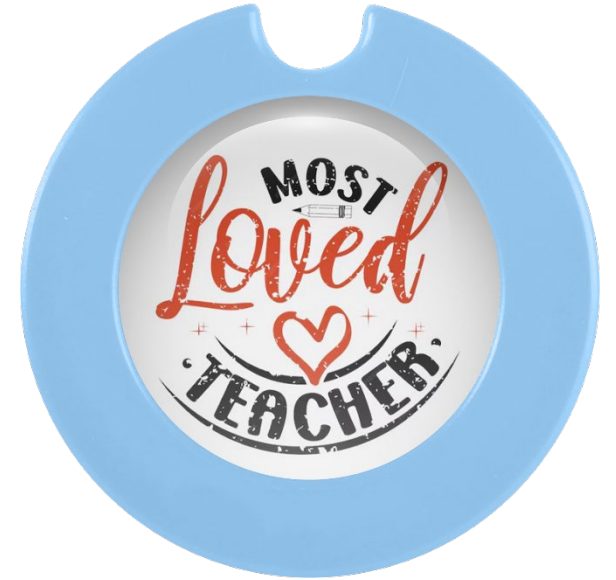
REF 301D - DOMED STICKER