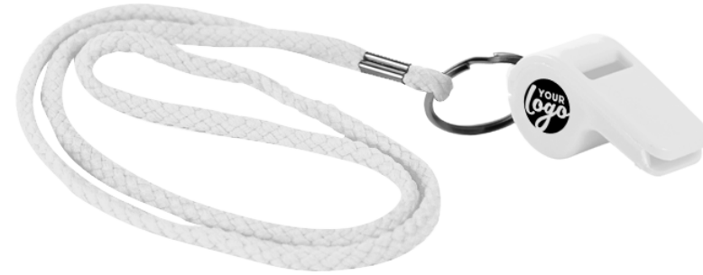
REF 712 - REFEREE WHISTLE WITH CORD LANYARD