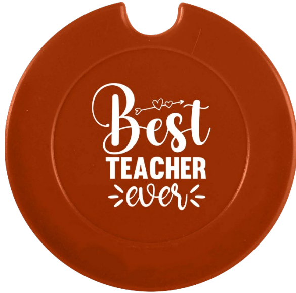
REF 301C - DIRECT PRINT