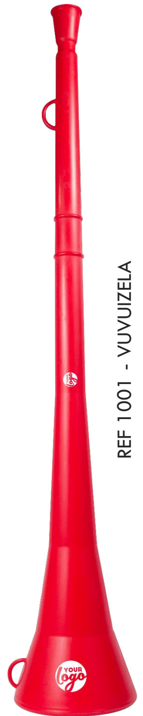
REF 1001 - VUVUZELA