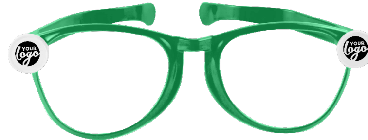
REF 1027 - FUN SOCCER GLASSES