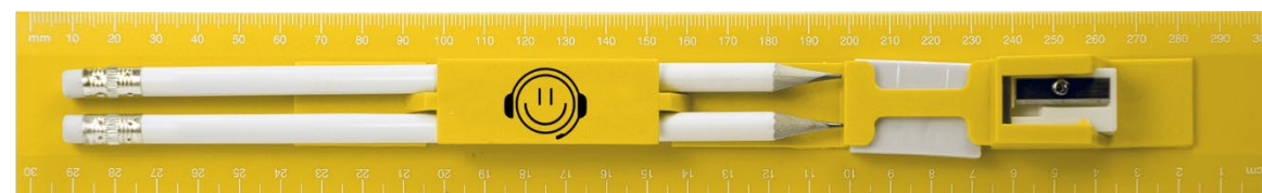
REF 556 - STATIONERY RULER 30CM