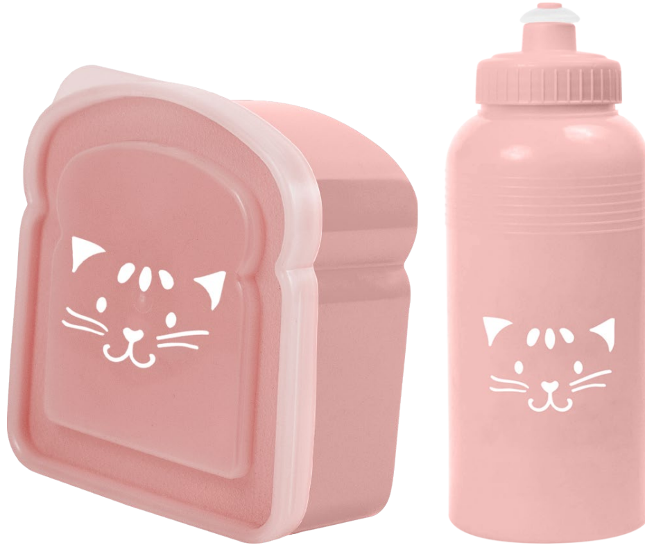
CLUB SLICE LUNCHBOX WITH STANDARD 500ML BOTTLE

REF 1063 – CLUB SLICE | REF 1229 - DAGWOOD