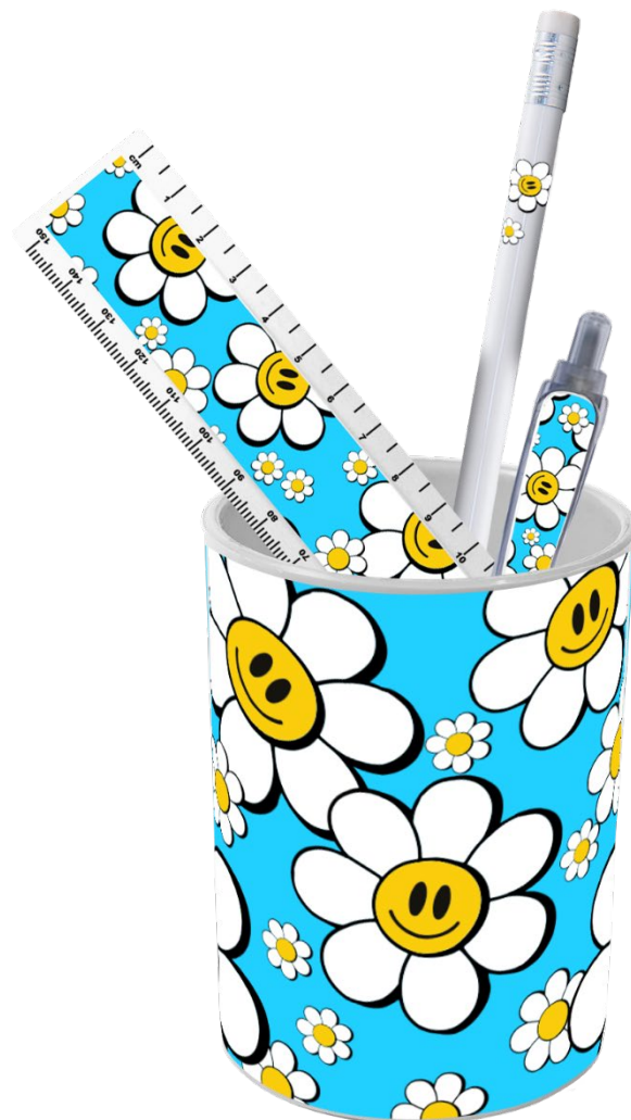
REF 512 - PENCIL CUP