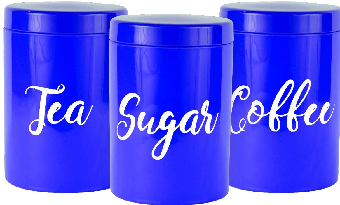
REF 1090 - 800ML CANISTER SET