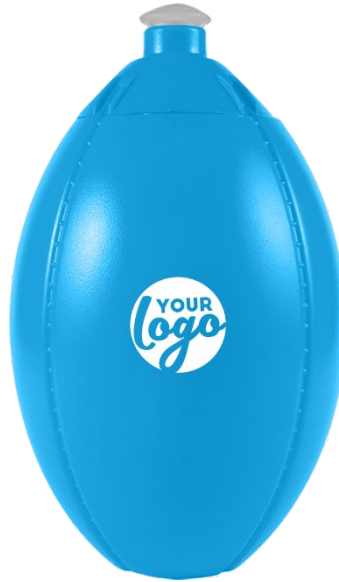
REF 424 -RUGBY MEMORY BALL 500ML